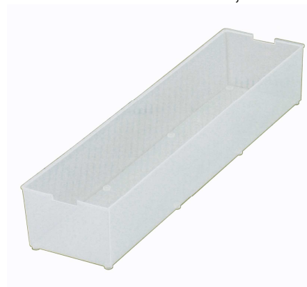
M10 L.405-W92,5-H57 mm