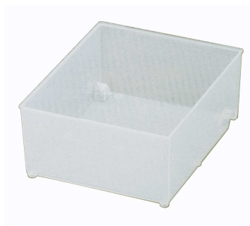
M9 L.152-W180-H57 mm