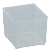
M5 L.75,5-W75,5-H57 mm

Note: Trays M10 and M9 (2 pcs) have position not changeable inside the drawer.