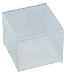
M8 L.151-W151-H57 mm