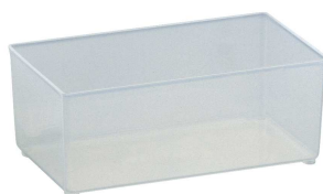
M6 L.151-W75,5-H57 mm